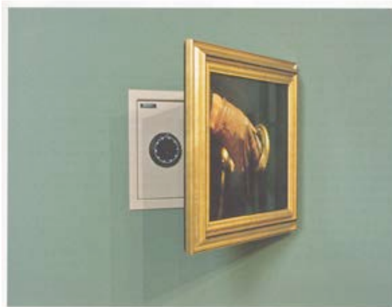
Safe, 1959, wall safe and framed 18-by-23-inch Iris print.

"Innuendo" favors the faint, shadowed, coded or