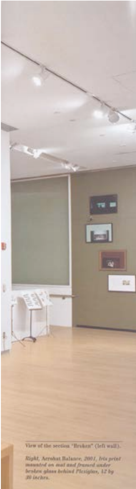
View of the section “Broken” (left wall).