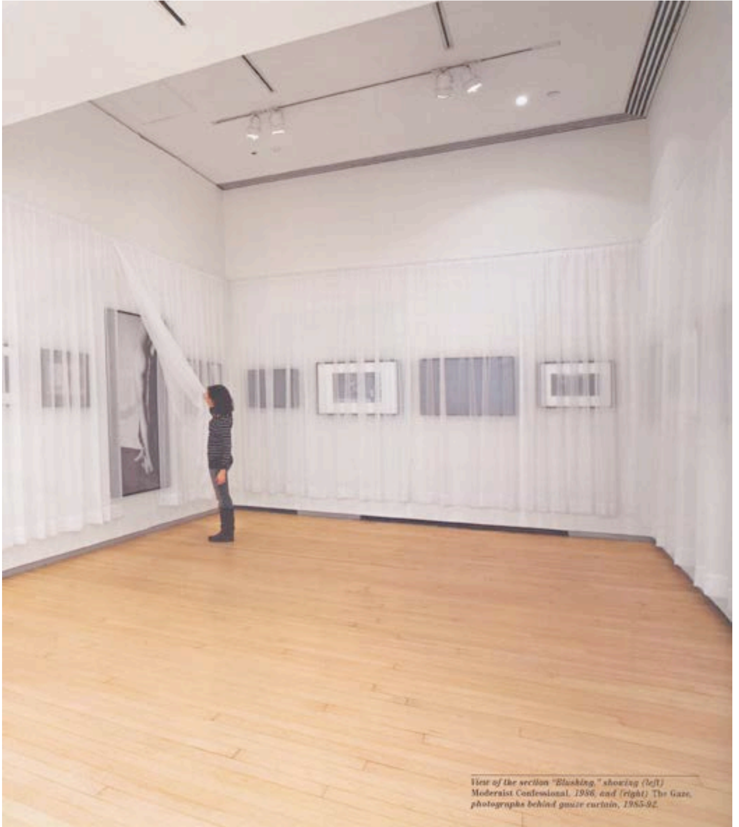
View of the section "Blushing," showing (left) Modernist Confessional, 1986, and (right) The Gaze, photographs behind gauze curtain, 1985-92.