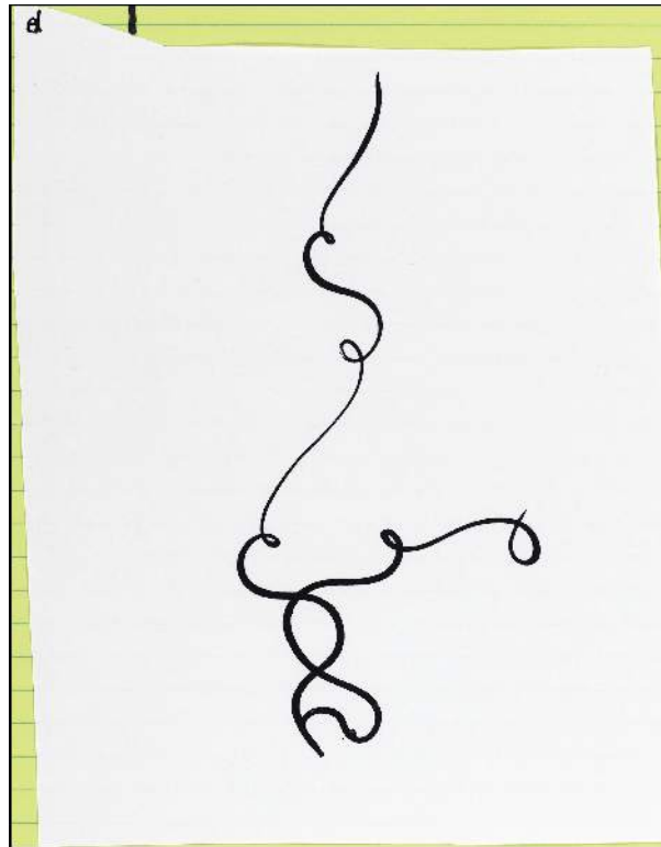
Opposite page: Matt Mullican performing under hypnosis at The Kitchen, New York, November 4, 1981.

MM: Yeah. I’m talking to you. We’re in my loft and I’m talking to you, but I’m not normal. So where am I? I’m . . . [ makes odd noise ] Too bad it’s not an audio magazine. It would be much more effective to hear my voice than to read it.