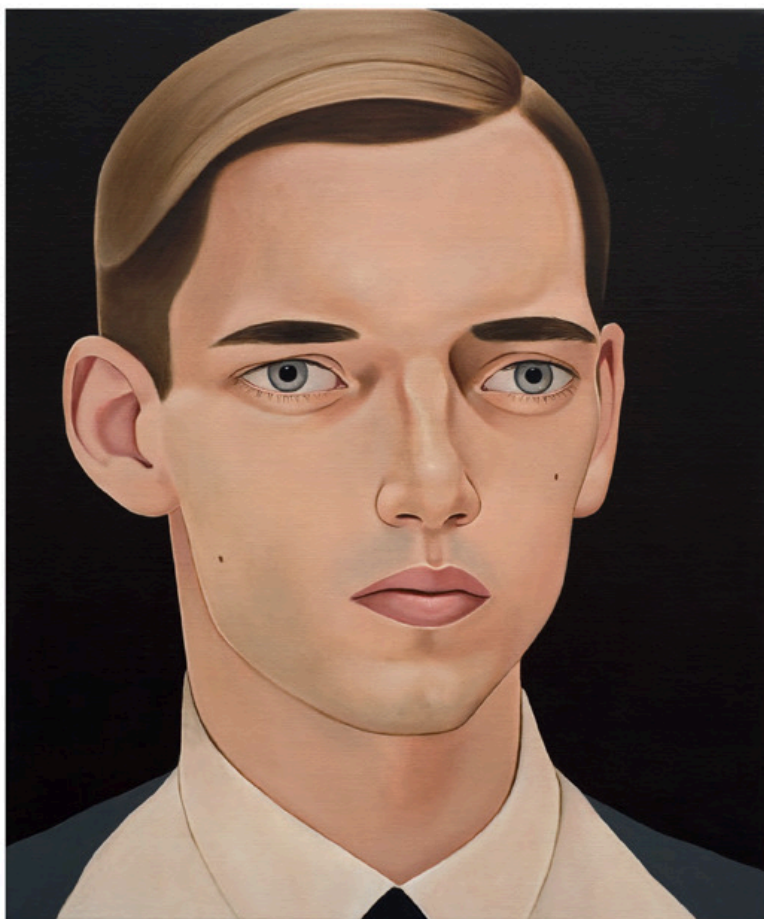
opposite Roman, 2010 Acrylic on linen, 50 x 60 cm