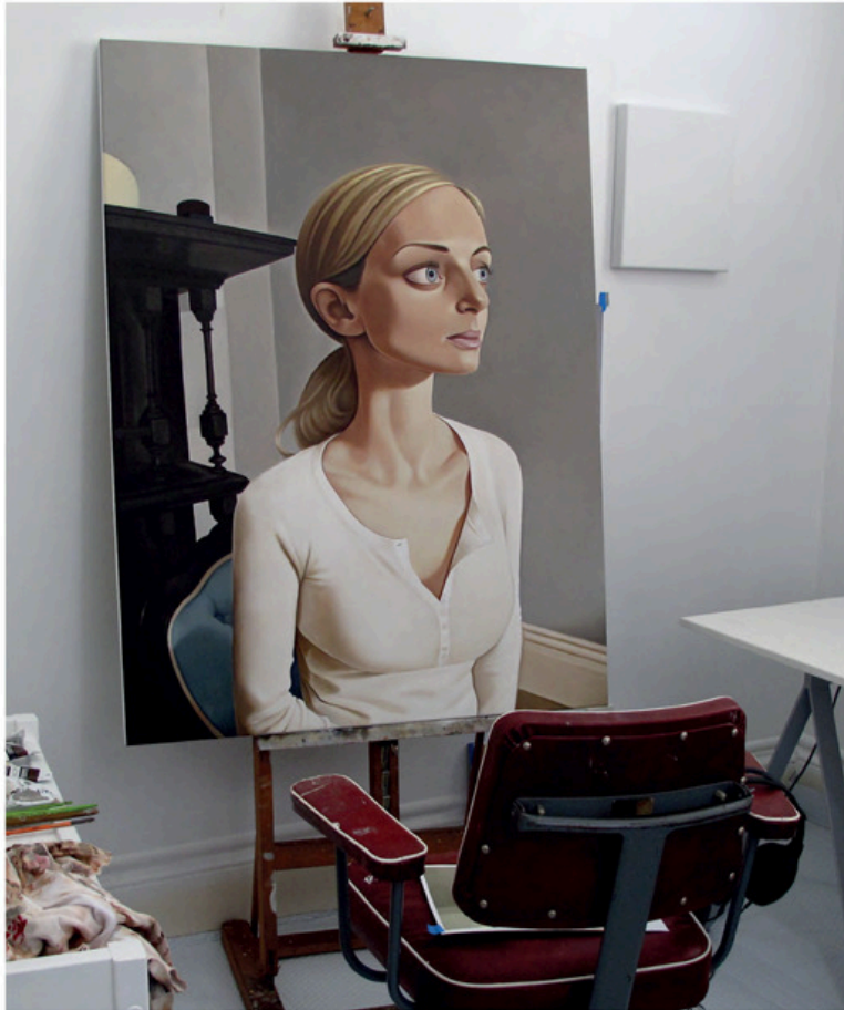
opposite Estelle, 2010 Acrylic on linen, 83.5 x 164 cm